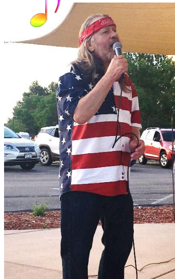
"Willie Nelson"