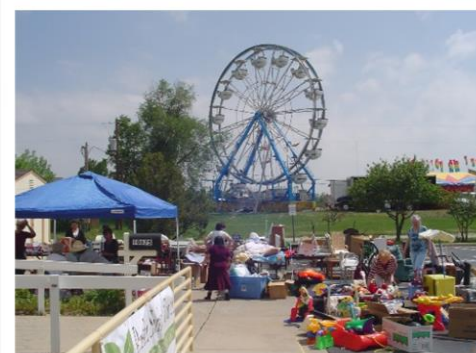
Garage Sale during Parker Days